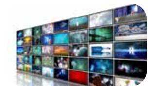
Flat Panel Display