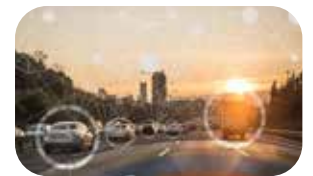
IoT/loV & Optoelectronics