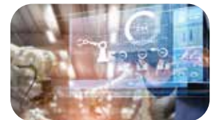
Industrial & Medical